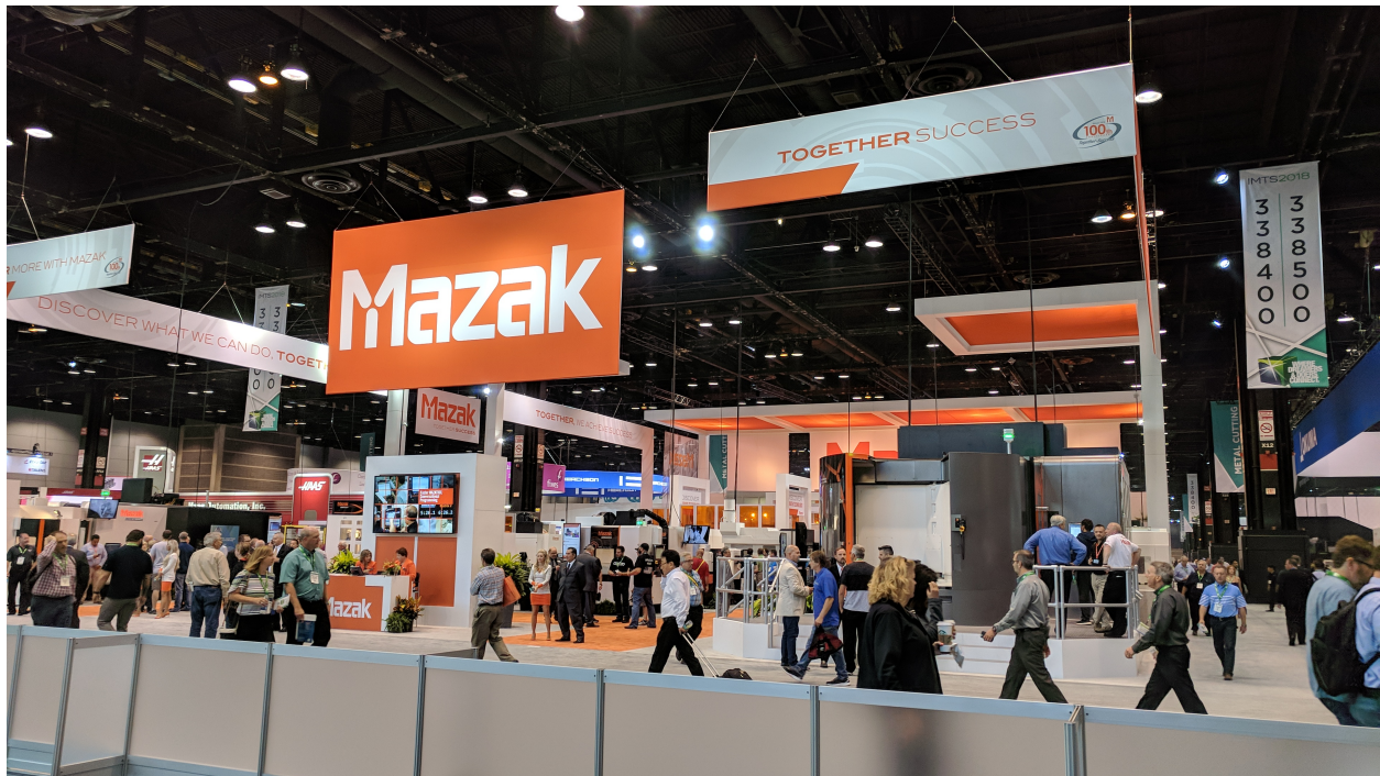
Figure 2018.1: A large booth at IMTS 2018. The company, Mazak, mainly sells metal-working machines such as lathes and milling machines. Everything is fully automated and computer controlled. The sheer size of the conference can be seen here, as this is just one booth in the huge conference hall—look down the hallway on the right-hand side.