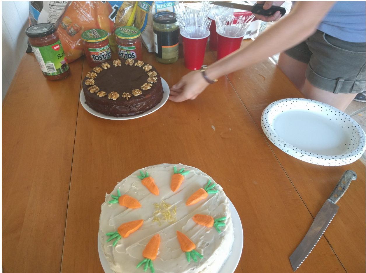
Figure 2016.3: The two wedding cakes that Claire baked for her own wedding.